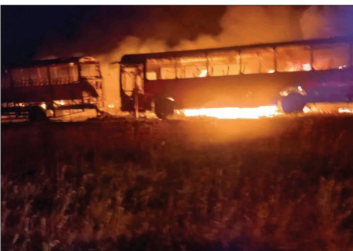
Several Putco buses were set alight allegedly by a group of armed men since January 27 evening from areas of Siyabuswa to Moloto leaving security officers hospitalised after they were shot.

SIYABUSWA - Putco buses' commuters in several areas including Siyabuswa were left stranded on 28 January morning following the torching of 35 buses.