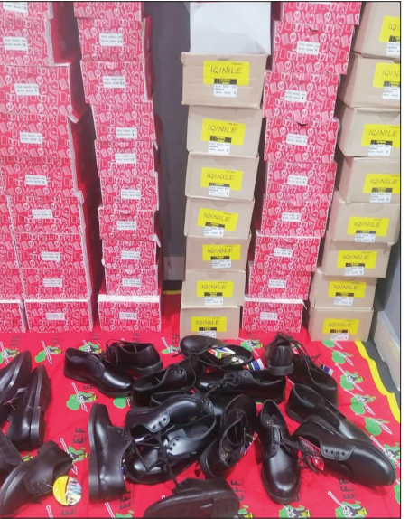
The EFF in Sekhukhune Region has committed to a School Shoes Donation Drive to support disadvantaged pupils in Sekhukhune communities.

motivated the party to donate is a historical background of the learners from Sekhukhune, who most are from the impoverished households and do not have the means to afford proper school uniform.