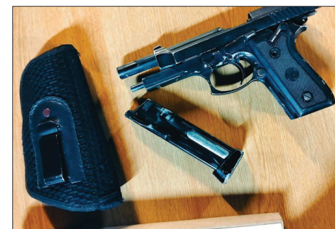
The Dennilton Police arrested a 32-year-old suspect in connection with a string of crimes including murder, armed robberies, car hijacking and common robberies committed in Dennilton policing area.