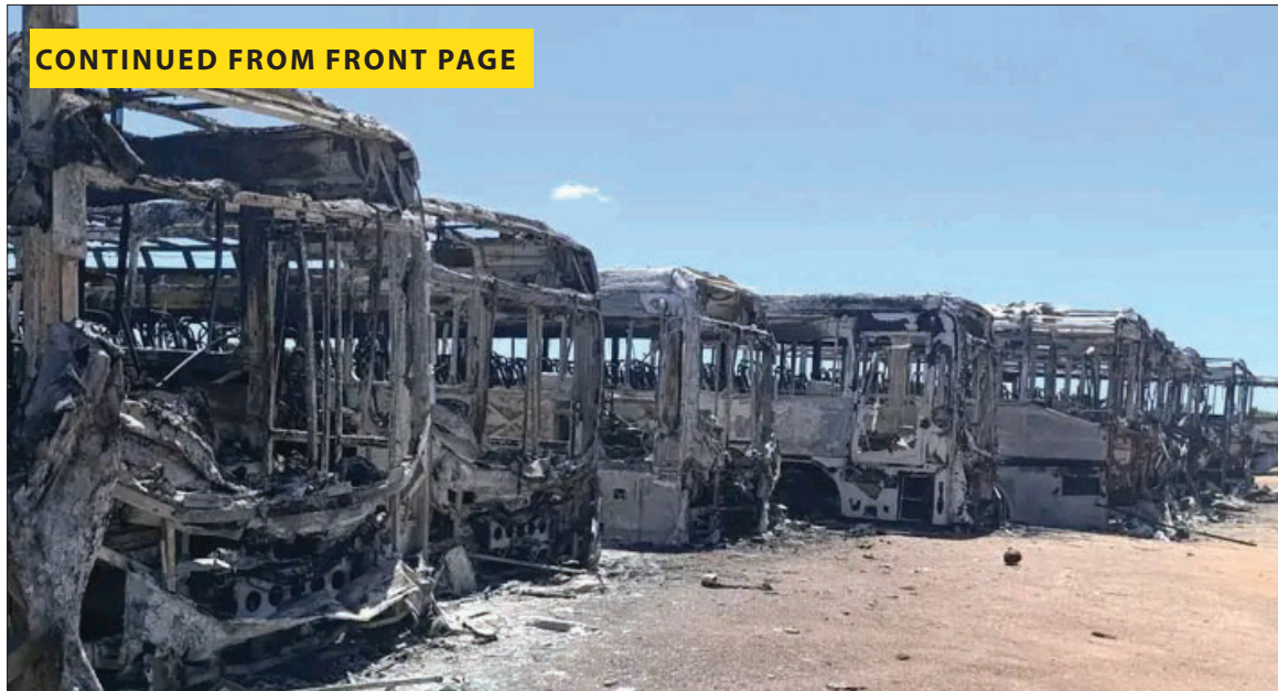
Bus Depots Under Attack: Buses Torched, Security Guard Assaulted in Siyabuswa