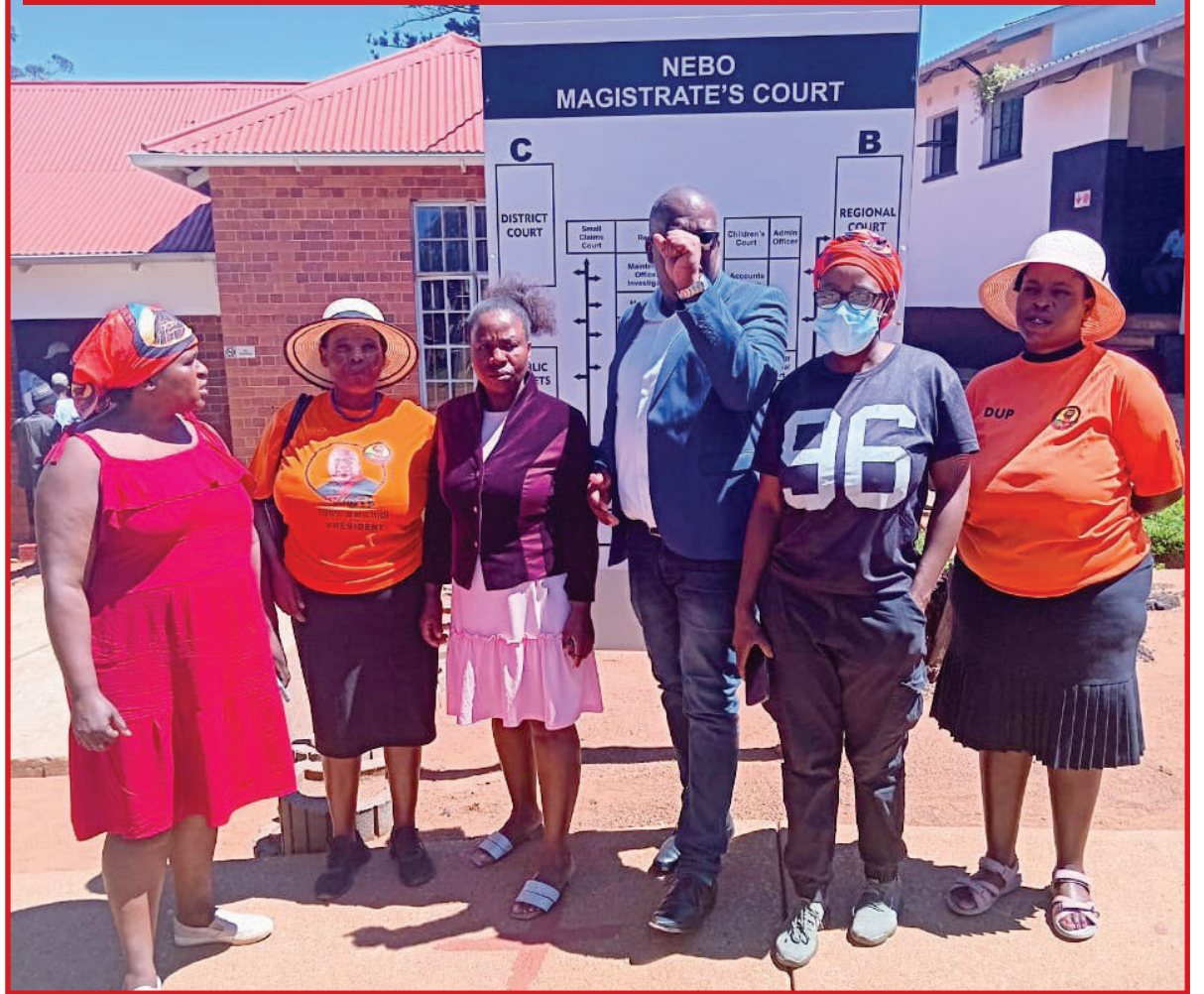
DUP members outside the Nebo Magistrate's Court to support one of their members who was allegedly assaulted during one of their spaza shops inspections programme.